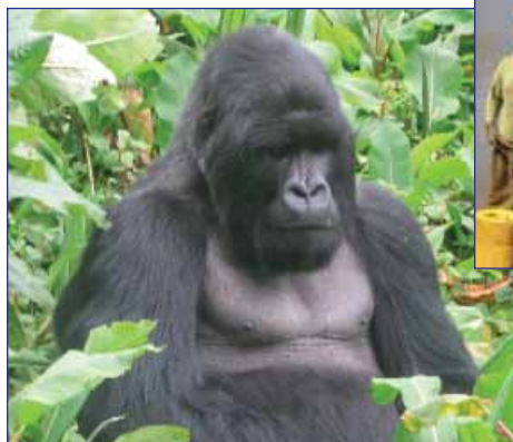
A silverback male mountain gorilla in his natural environment.