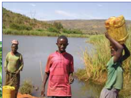
Rwandans collecting their water daily